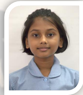
ADHIRA.A 5 - A 3972

Friends are there to help you, Be it marks or behavior, A true friend will hold your arms forever.